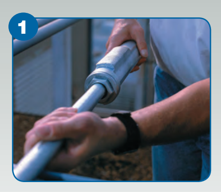
Slide the fitting onto the conduit until it stops at the internal sliding bushing. Tighten and you're ready. No parts to reassemble!