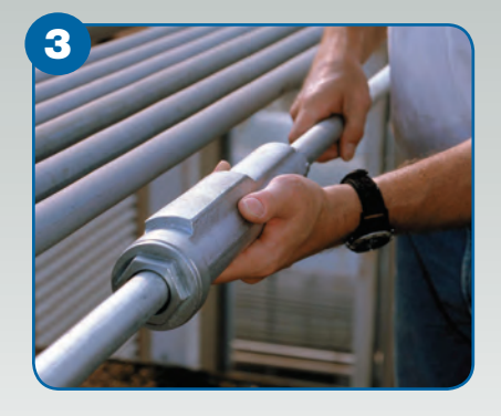
Thread the next length of conduit into the other end of the fitting and tighten. You're done!