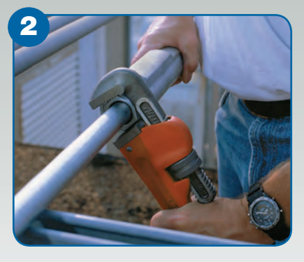
With a wrench, tighten the gland nut to compress the Teflon® packing, creating a raintight seal around the conduit.