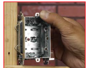
Outside Wall - 2x4 + lath (forenze)

Position the box using guides for outside wall applications and secure with screw(s) or nails.