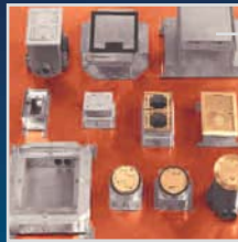
Steel City® Floor boxes, poke-through system and accessories; fasteners, hangers and clamps