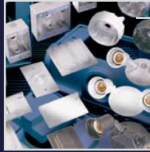
Red Dot®/Iberville® FS Covers, drytight boxes, vapourtight boxes