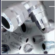
Iberville® Cable connectors, cord and liquidtight connectors, staples, nailing straps and hardware