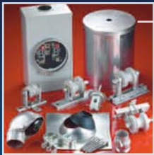
Microelectric® Meter sockets, mast kits and pole line hardware