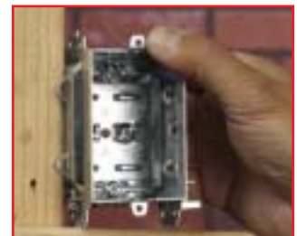
Outside Wall - 2x4 + lath (forenze)

Position the box using guides for outside wall applications and secure with screw(s) or nails.