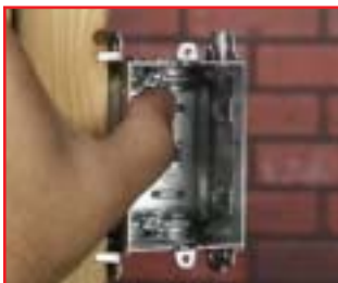
1/2 in. Drywall

Position the box using 1/2-inch drywall guides and secure with screw(s) or nails.