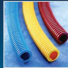
Carlson® Conduit, enclosures, door chimes and flexible raceway systems

IBERVILLE® steel device boxes have been designed and manufactured in St-Jean-sur-Richelieu (Iberville), Quebec since 1920. Backed by a dedicated Canadian-based engineering, marketing and customer service team, as well as extensive, cross-Canada sales coverage, the IBERVILLE®/Thomas & Betts brandname is your assurance of safe, secure and efficient device box installations every time.