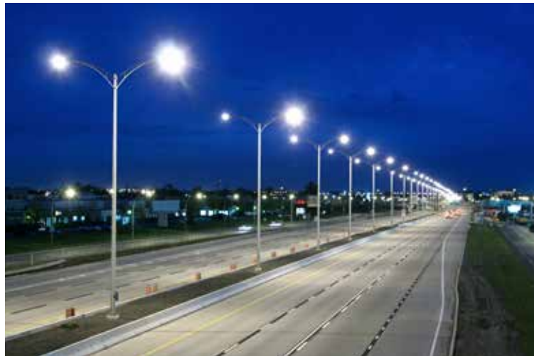
ABB Installation Products Ltd. Electrification Products division 700 Thomas Avenue Saint-Jean-sur-Richelieu, Quebec J2X 2M9 Tel.: +1 (450) 347 5318 Toll Free: +1 (800) 362 2952 Fax: +1 (450) 347 1976