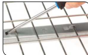
Push tabs down.