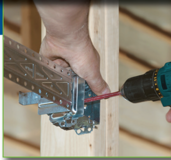
Screw bracket on box.