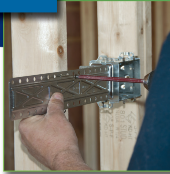
Screw bracket to opposite wood stud.