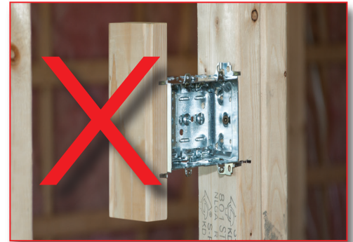
This installation does NOT COMPLY with C.E.C. 12-3010 (3).