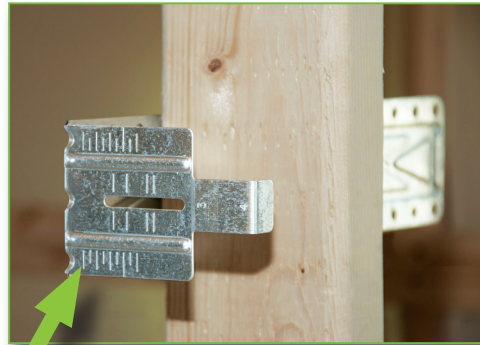
Using the guides built into the bracket, box depth can be adjusted to fit the application.