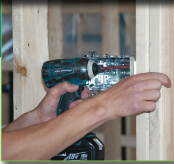
Screw box on stud.