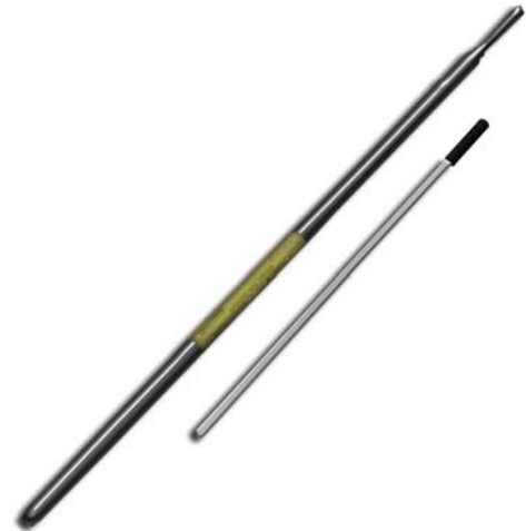
Photo includes ground rod driver and insert