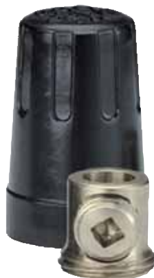
For copper wire only