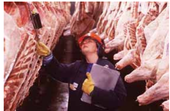
The T&B High/Low Temperature Liquidtight System suits the demanding conditions of food processing plants such as freezers and washdown areas.

The following pages offer a brief explanation of products useful in extreme temperature settings for food and beverage processing plants.