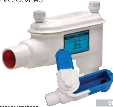
Interior urethane coating shown in sample cutaway