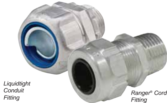
Liquidtight Conduit Fitting