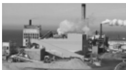
Pulp & Paper Mills