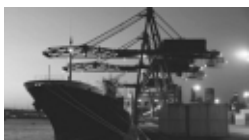
Marine and Shipboard