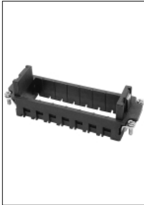
7-slot Female Insert Holder F7F024M

Select one each male and female 7-slot insert holders for B24 housings, then select seven each of any male and female M series inserts from pp.41-46.