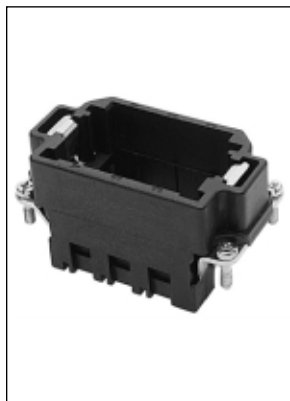
3-slot Male Insert Holder F3M110M