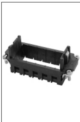
5-slot Female Insert Holder F5F016M

Select one each male and female 5-slot insert holders for B16 housings, then select five each of any male and female M series inserts from pp.41-46.