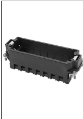
7-slot Male Insert Holder F7M124M

Note: AF1024M Optional Insert Holder available (+7 insert) Positions T-Z for B48 Housings.