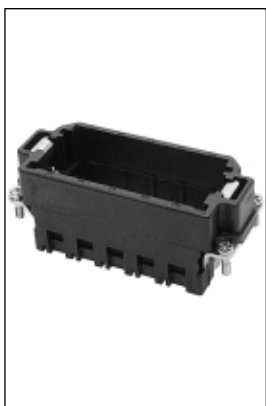
5-slot Male Insert Holder F5M116M

Note: AF10F216M Optional Insert Holder available (+5 insert) Positions V-Z for B32 Housings.