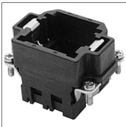
2-slot Male Insert Holder F2M106M