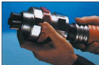
2. Install StarTeck XP® on cable