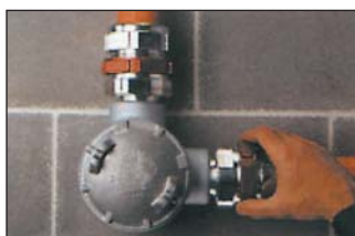
6. Insert cable and tighten red union