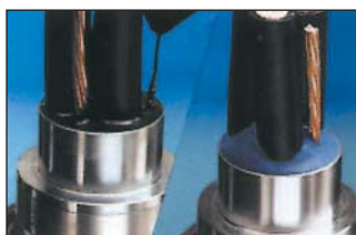
4. Pot cable (using liquid or putty)