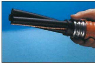
1. Prepare cable