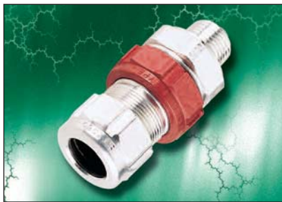
Series StarTeck XP® (STX)

Star Teck XP® cable fittings are designed to accommodate a broad range of cables, thereby minimizing the possibility of mismatched cables and fittings in the field. They are available in hub sizes from 1/2 to 4 inches, and will handle outer jacket diameters from 0.525 to 4.185 inches.