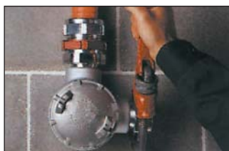
5. Install hub on enclosure