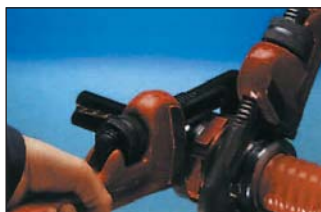
3. Tighten gland nut