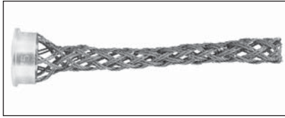
Wiremesh grips support the following Liquidtight Cord Fittings Series.