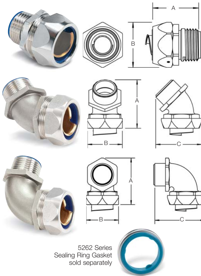
5262 Series Sealing Ring Gasket sold separately