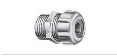
Body and gland nut are aluminum.