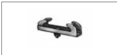
Includes bolts. Steel.