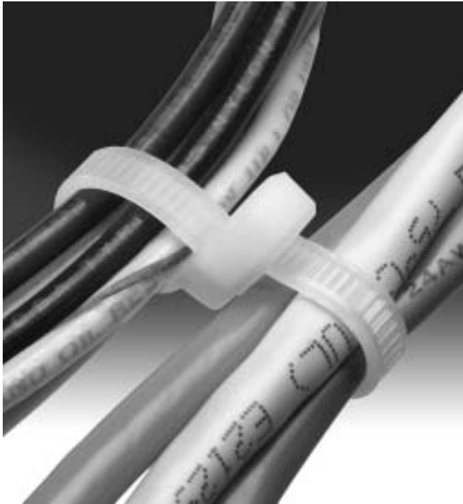
Double Loop ties allow the parallel routing of two bundles of cable with one single tie. Available in 3 different lengths.