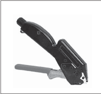
A lightweight, pocket size hand tool which quickly and easily applies standard-size stainless steel ties.