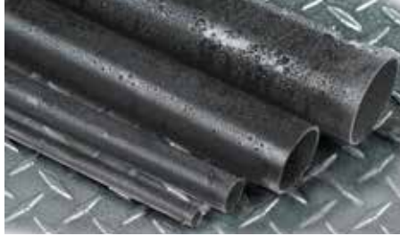
Heavy-wall heat-shrinkable tubing